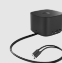
HP USB-C / A Dock G2