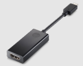
HP US-C adapters