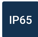
IP65 (front side)