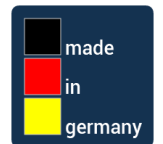
Made in Germany