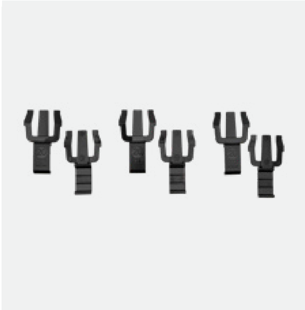
(3pk) SKU: 171020