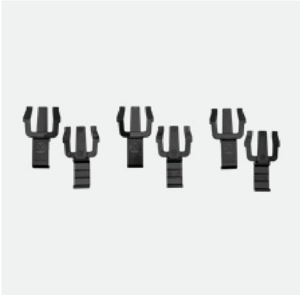
(3pk) SKU: 127124