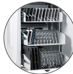
3x pull-out drawers for 11 devices each