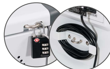
anti-theft fixing brackets at the rear and side panels of the trolley