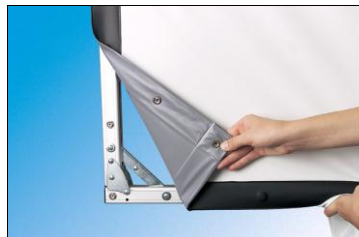
Projection surface with push buttons